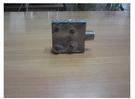
Figure 3. The air-jet sonic generator with two resonators

The calculation of air-jet sonic generator with two resonators determined its construction of stainless steel type 20 Cr 120 as shown in figure 3.