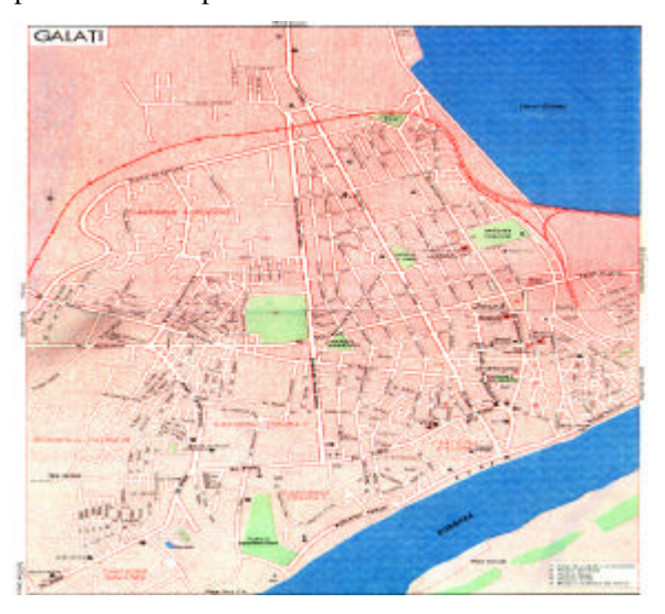
Fig.1. The urban area of Galati: the end-point of photochemical pollutants prediction.

where there are no measurements, as well as to be distributed to local authorities, and local radio and TV stations, in order to make announcements to the public and take preventive actions.