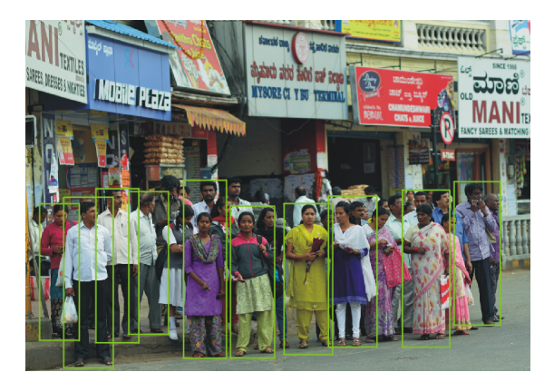
Fig.2. Image of pedestrians waiting at a crossing in India (Image source Wikipedia)

- It is virtually impossible to predict the behavior of pedestrians, therefore the detection system should have a very good reaction time.