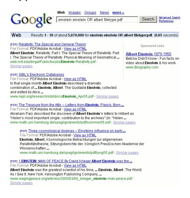
Fig.3. Search result for Albert Einstein in Google search, restricting the search only for pdf files

In Google, if we search for an author name as keyword, we rarely retrieve scientific papers written by that author, at least not in first page of results. We find links to their home page, or links to their bibliography. For this reason, we open the advanced search page and select the option file type to retrieve only pdf documents.